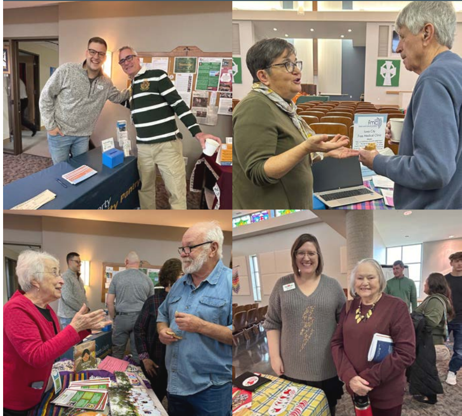
FCC folks talk with community partners at the Alternative Gift Market.