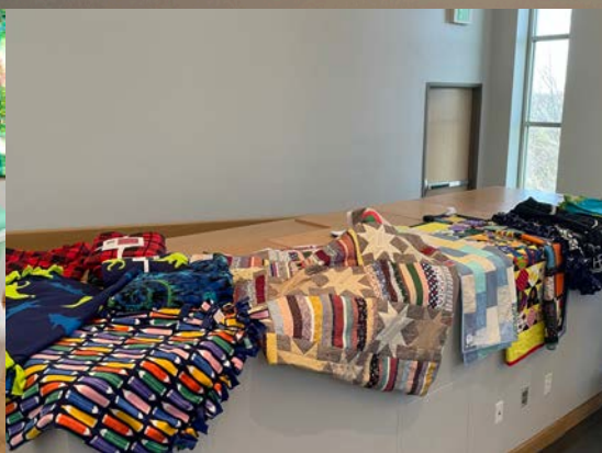
Cards made by children for asylum seekers in Arizona, gifts from FCC people for Open Heartland families and blankets made for Habitat for Humanity families.