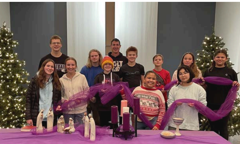
Above: JYF children gather for a sack lunch & nature hike. Below: Chi Rho & CYF youth decorate for Advent.