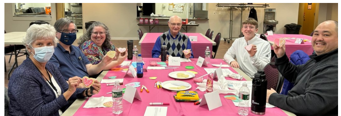
Below: Faith Formation cookie decorating.