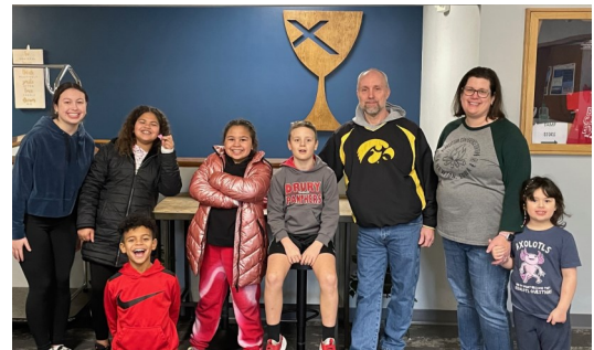
Above: FCC's participants in the regional Junior Retreat.