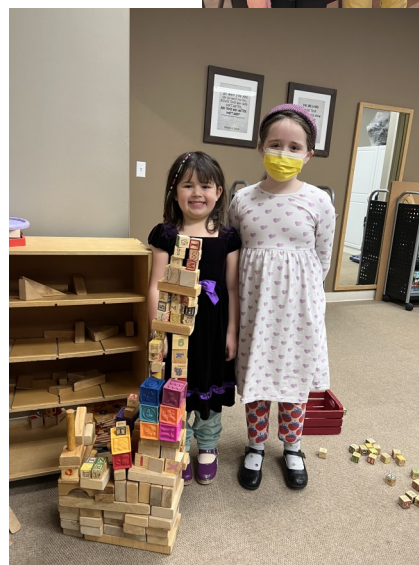
Left: Sunday School kids building a "house on rock" after learning the Bible story.