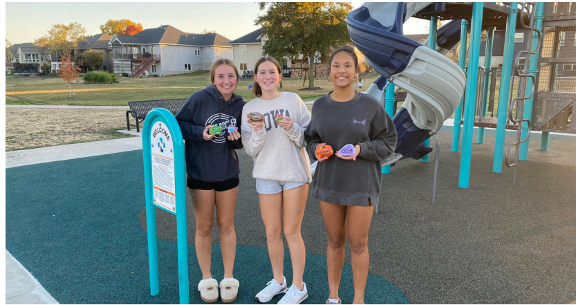
Above: High school youth deliver painted rocks to a local park.

If you'd like to participate in music at FCC, please contact Pastor Laura .