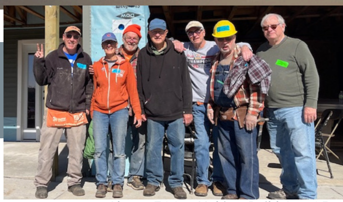
Above: FCC @ Habitat Build Oct. 25

supporting Open Heartland welcoming • including • strengthening