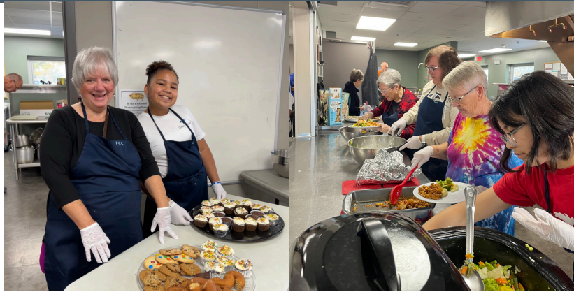
Above: FCC serves at the Free Lunch Program on October 26.

We still have slots to fill for people to receive food, serve, and then clean up. If you can help, please sign up here .